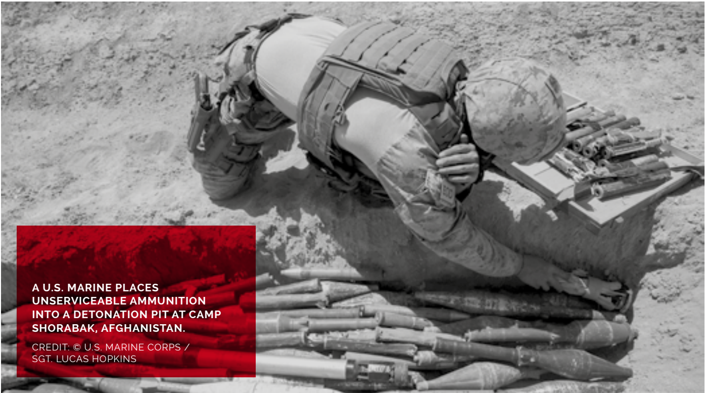
A U.S. MARINE PLACES UNSERVICEABLE AMMUNITION INTO A DETONATION PIT AT CAMP SHORABAK, AFGHANISTAN.