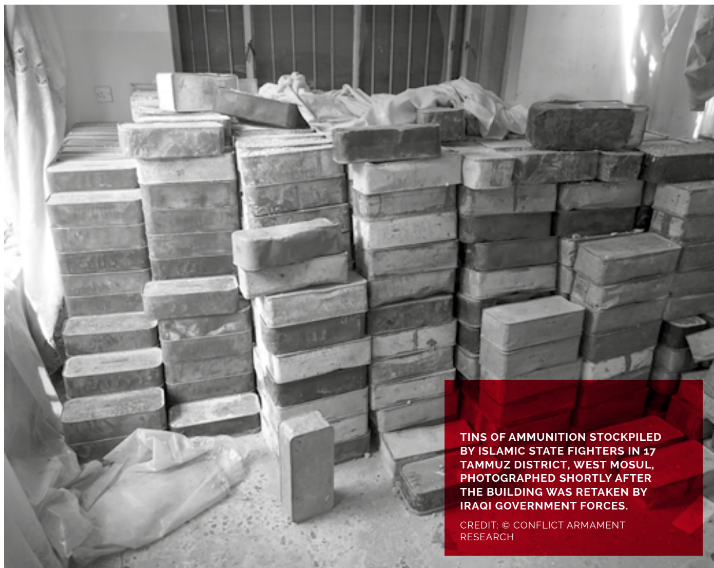
TINS OF AMMUNITION STOCKPILED BY ISLAMIC STATE FIGHTERS IN 17 TAMMUZ DISTRICT, WEST MOSUL, PHOTOGRAPHED SHORTLY AFTER THE BUILDING WAS RETAKEN BY IRAQI GOVERNMENT FORCES.

This section looks solely at transfer data as reported by each State Party in its Annual Report. It does not compare the data with other relevant reporting mechanisms or findings by independent experts, such as media sources, national reports to parliamentary authorities, or the work of think tanks such as the Arms Transfer Database of the Swedish International Peace Research Institute (SIPRI). Integrating information from such external sources would likely cast a different picture of the global arms trade, particularly the percentage of trade between countries. In order for the analysis conducted by the ATT Monitor and others to be as accurate as possible, it is critical that States Parties submit clear and comprehensive Annual Reports, and that they take reporting as an opportunity to support the ATT's goal of greater transparency in the global arms trade.