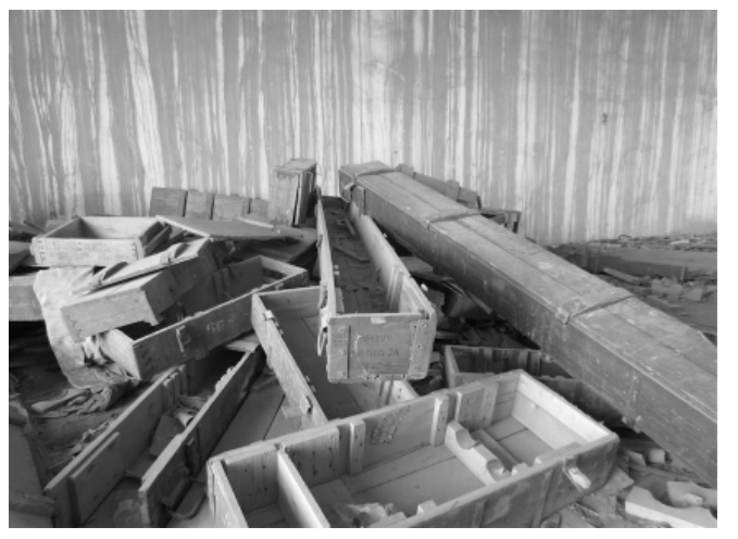
Image 1: Looted Forces Armées Maliennes (FAMa) stocks, south of Gao, originally containing 122 mm 9M22U multiple-launch rockets, 120 mm OF-843B mortar rounds, 122 mm OF-56 artillery rounds, 76 mm BR anti-tank rounds, 7.62 x 54R mm PS GZh and B32-GS machine gun ammunition, and 14.5 x 114 mm BZT-GS heavy machine gun ammunition, March 2015.

This obligation is linked closely to the requirement for exporting States to assess the potential negative consequences of a proposed export under Article 6 (Prohibitions) and Article 7 (Export and Export Assessment). Under Article 7, States must carry out a comprehensive risk assessment to investigate the likelihood that arms might be used to commit or facilitate: a serious violation of international humanitarian law [Article 7.1(b)(ii)] or international human rights law [Article 7.1(b)(iii)], an act constituting an offence under international conventions or protocols relating to terrorism [Article 7.1(b)(iii)] or transnational organised crime [Article 7.1 (b)